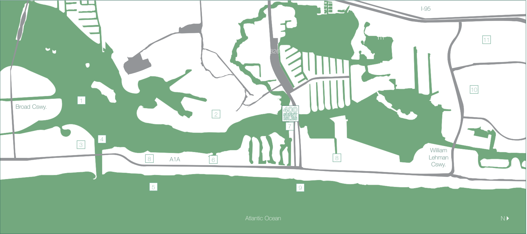
1. Biscayne Bay 2. Oleta River State Park 3. Bal Harbour Shops 4. Intracoastal Atlantic Ocean access 5. Sea Turtle Sanctuary 6. Haulover Golf Course 7. 400 Sunny Isles Residences 8. Sunny Isles Business District 9. Sunny Isles Beach 10. Turnberry Isle Golf Course 11. Aventura Mall