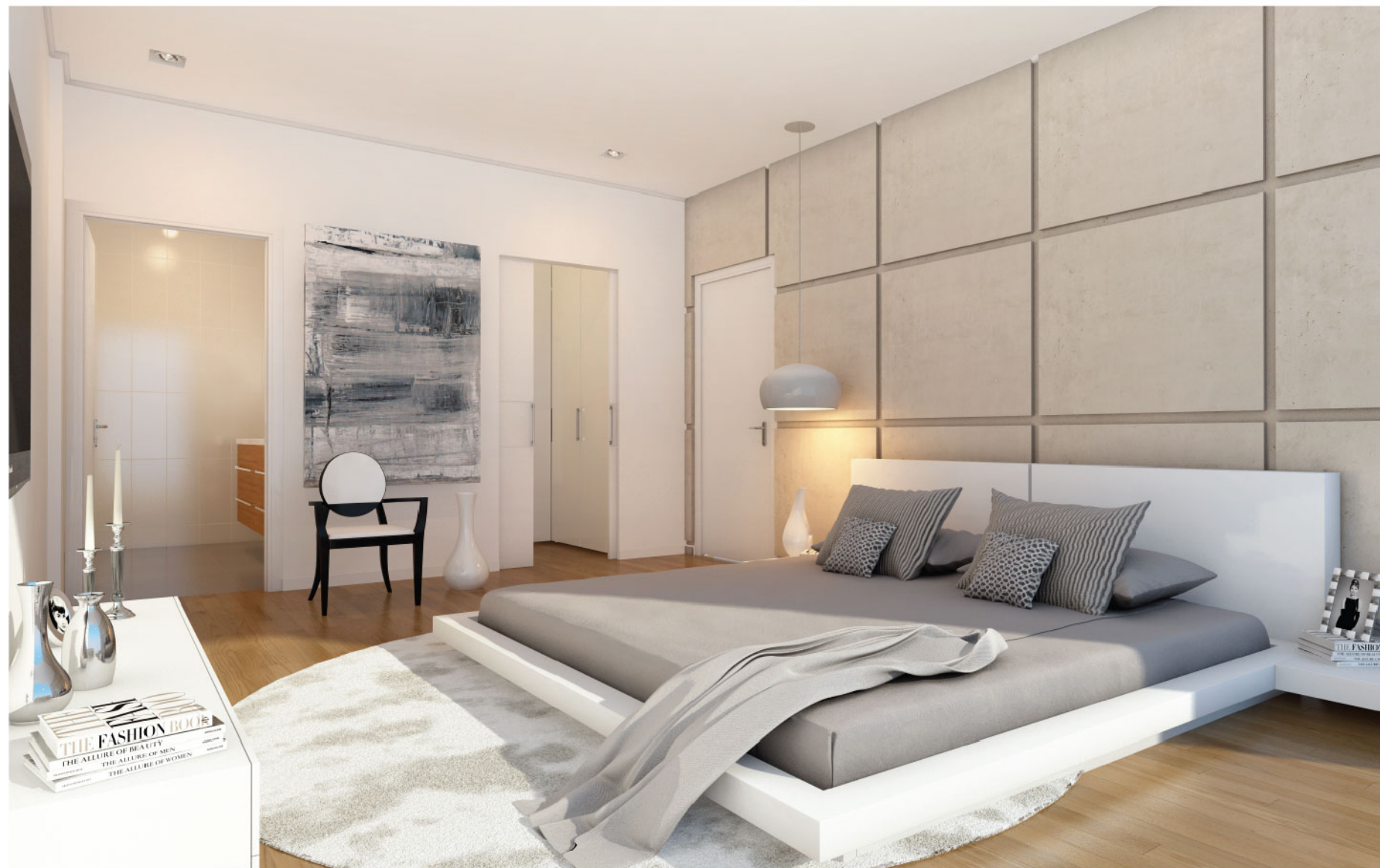
Wide and luminous bedrooms with ideal views to relax and enjoy a pleasant ambience.