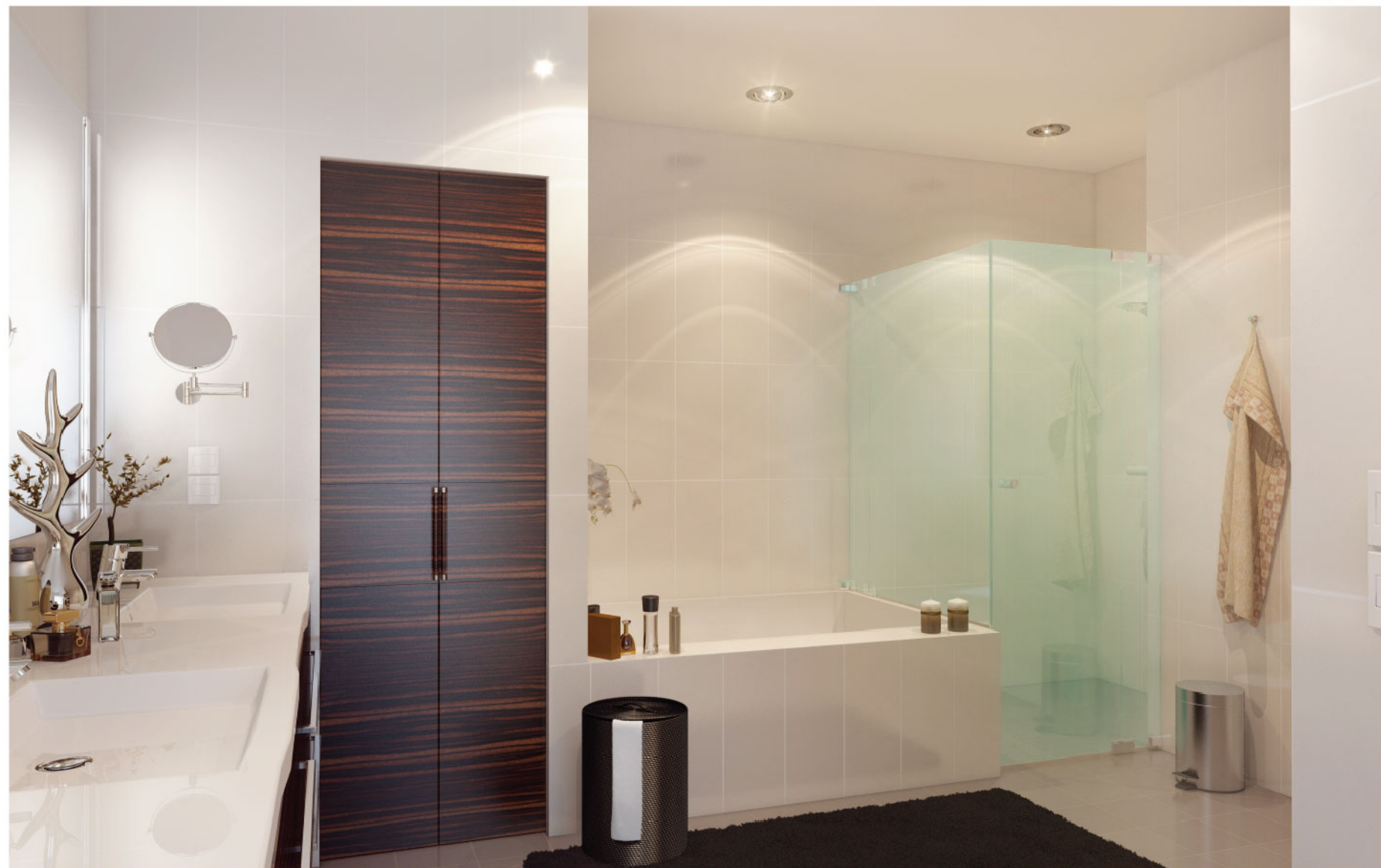
Design is the main character of the residences with marble floors and luxurious Jacuzzis in bathrooms.