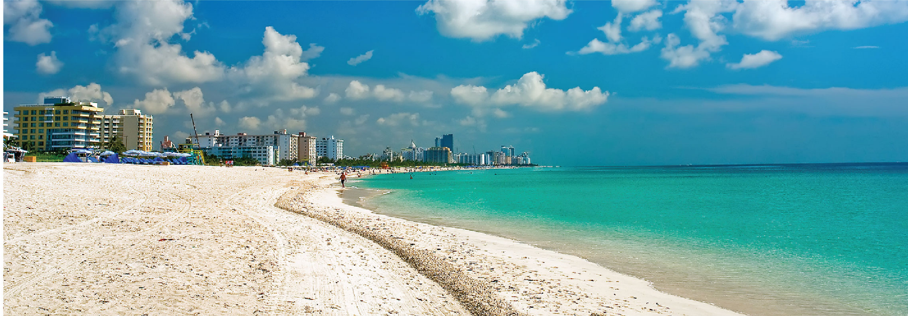
As an icon of 21 st century architecture, Kai at Bay Harbor stands stunningly along North Miami's coast.