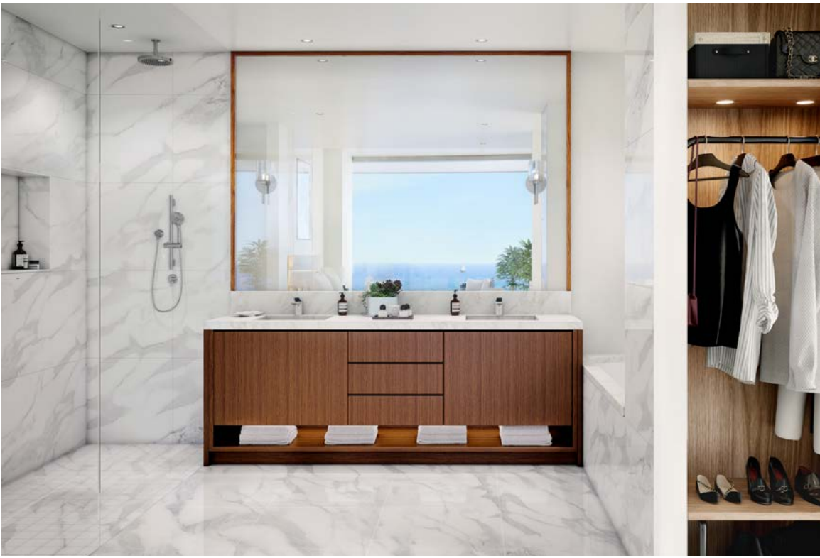
Sleek and spa-like, the master bathrooms feature a material mix of natural stone selections, stained wood and porcelain tile, creating an atmosphere of peace and relaxation.