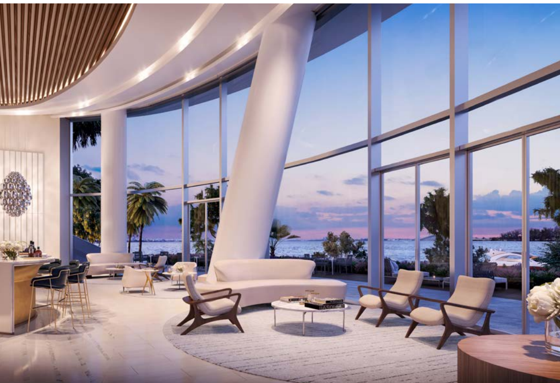
The private owners' lounge, adjacent to the lobby, features a double height bank of windows with sweeping views of the water and the private gardens.