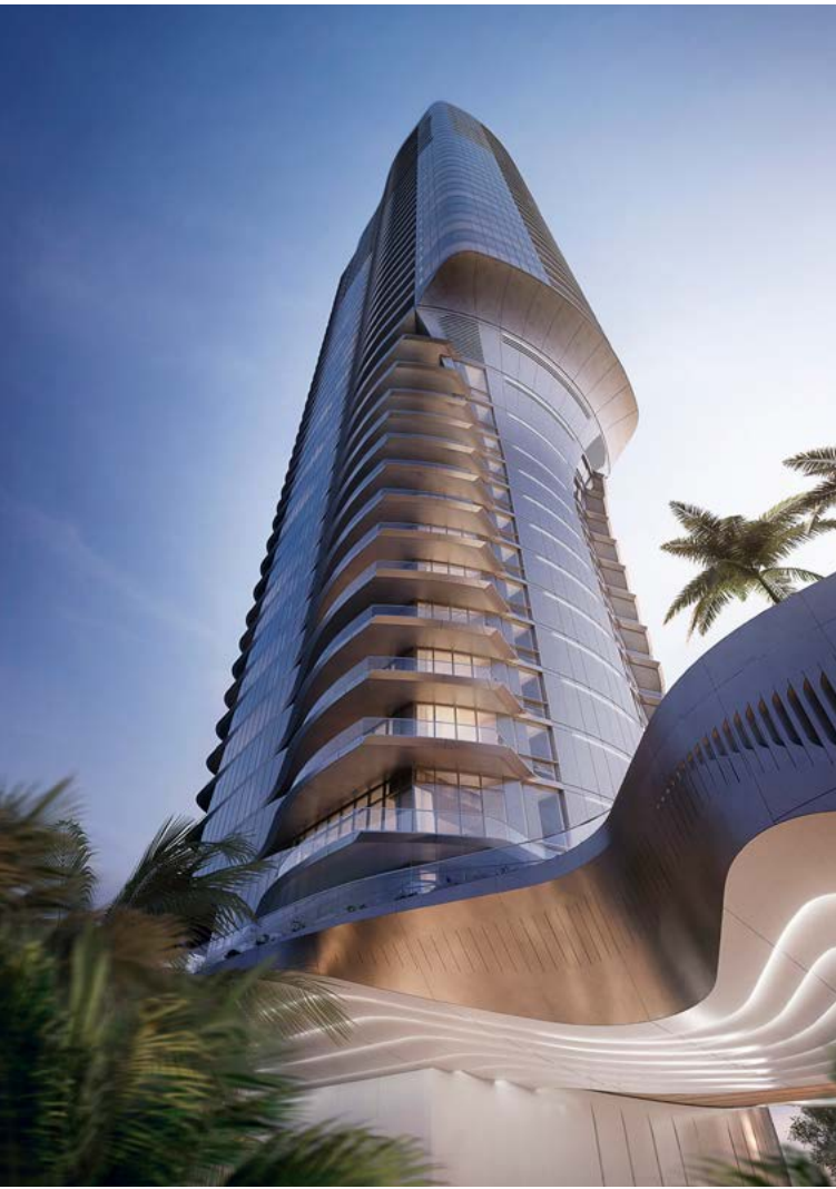
The dramatic entryway at Una is marked by a curvilinear double-height porte cochère.

DESIGN From a distance, the iconic tower is recognizable by the smooth, light-metallic surface and striking silhouette that recalls the natural shape of a wave. Once inside, residents are met with stunning views of Biscayne Bay at every turn. Floor-to-ceiling windows welcome daylight into each open-plan space, while extra wide terraces are carefully integrated into the great rooms and bedrooms. The result is a seamless transition between inside and outside, celebrating the pleasures of life on the bay.