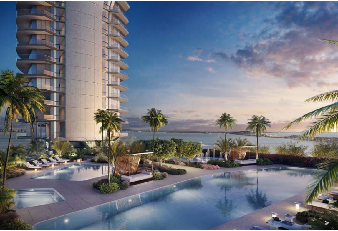
A unique oasis, the third-floor pool deck offers a lap pool, family pool and a children's play area, along with cabanas and outdoor bars.

AMENITIES Una's amenities represent the best of leisure, wellness, and entertaining—offering a range of curated indoor and outdoor spaces, all set around spectacular Biscayne Bay. Whether enjoying a relaxing afternoon on the bayfront pool deck, or entertaining in the private dining room and party space, residents have a range of amenity options to enjoy. The spa and gym, elegantly envisioned by the chairman of Aman, promote health and wellness while maximizing water views. Una is family friendly, with a colorful children's play area, perfect for the younger generation of residents.