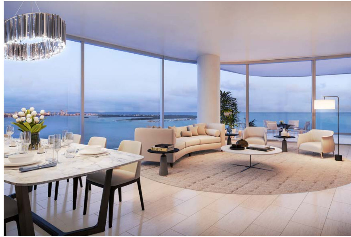
Floor-to-ceiling windows in main living areas enhance the breathtaking bayfront views.

DESIGN From a distance, the iconic tower is recognizable by the smooth, light-metallic surface and striking silhouette that recalls the natural shape of a wave. Once inside, residents are met with stunning views of Biscayne Bay at every turn. Floor-to-ceiling windows welcome daylight into each open-plan space, while extra wide terraces are carefully integrated into the great rooms and bedrooms. The result is a seamless transition between inside and outside, celebrating the pleasures of life on the bay.