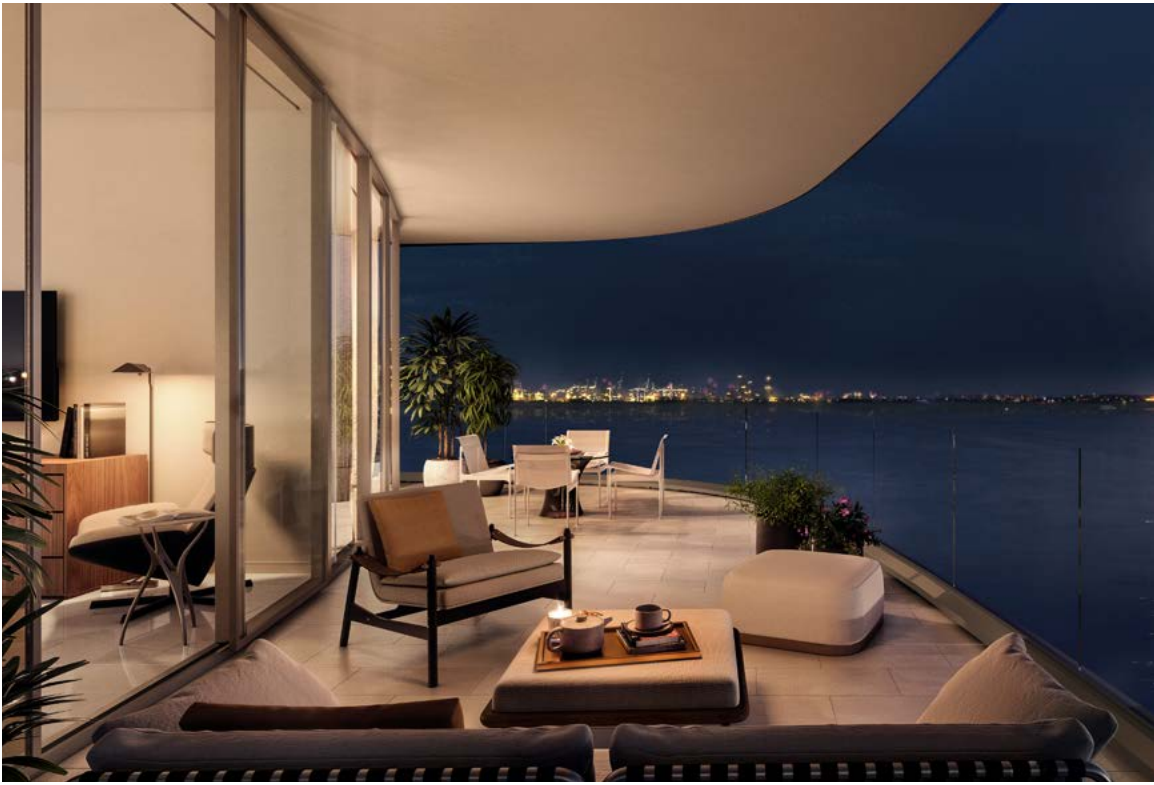
The sublime views of Biscayne Bay and beyond can be enjoyed to the fullest on the 10-foot-deep terraces.