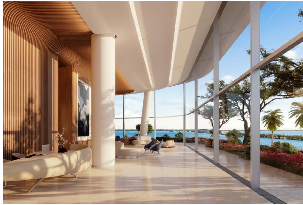
The level of craftsmanship in the lobby is instantly breathtaking, with wood and precious detailing permeating the 20-foot-high space and a long bank of windows framing the sparkling views of the bay.